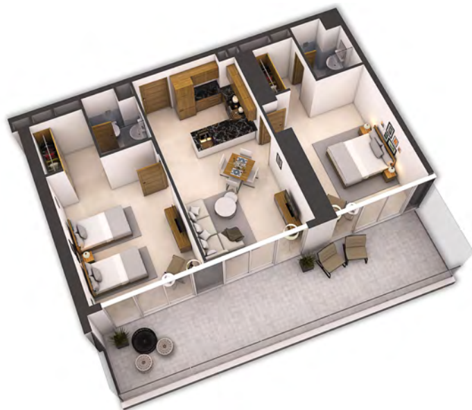
TOWER B 2 BEDROOMS