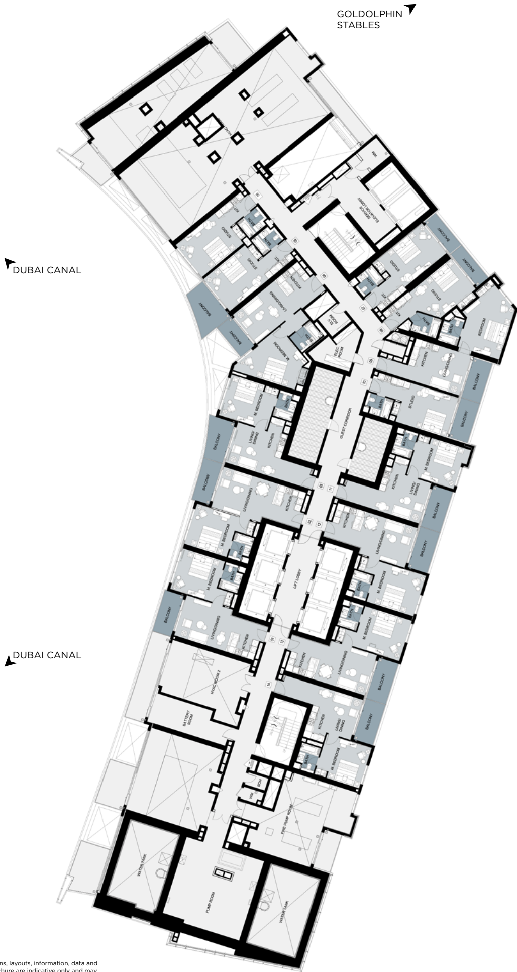
TYPICAL FLOOR PLANS