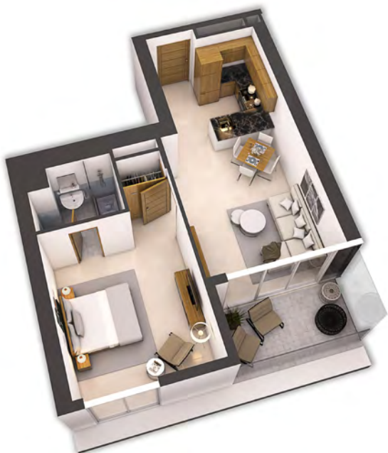
TOWER B 1 BEDROOM