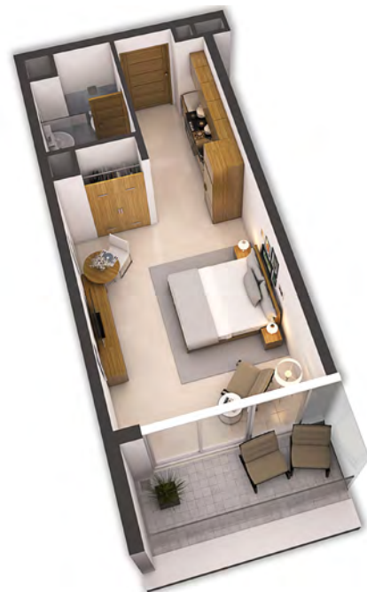
TOWER B STUDIO